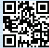
Registration QR code