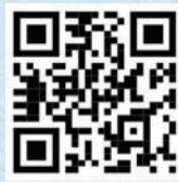
College Location QR code